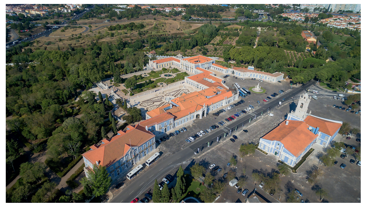
2 National Palace of Queluz, the Royal Villa in the Periphery of Lisbon