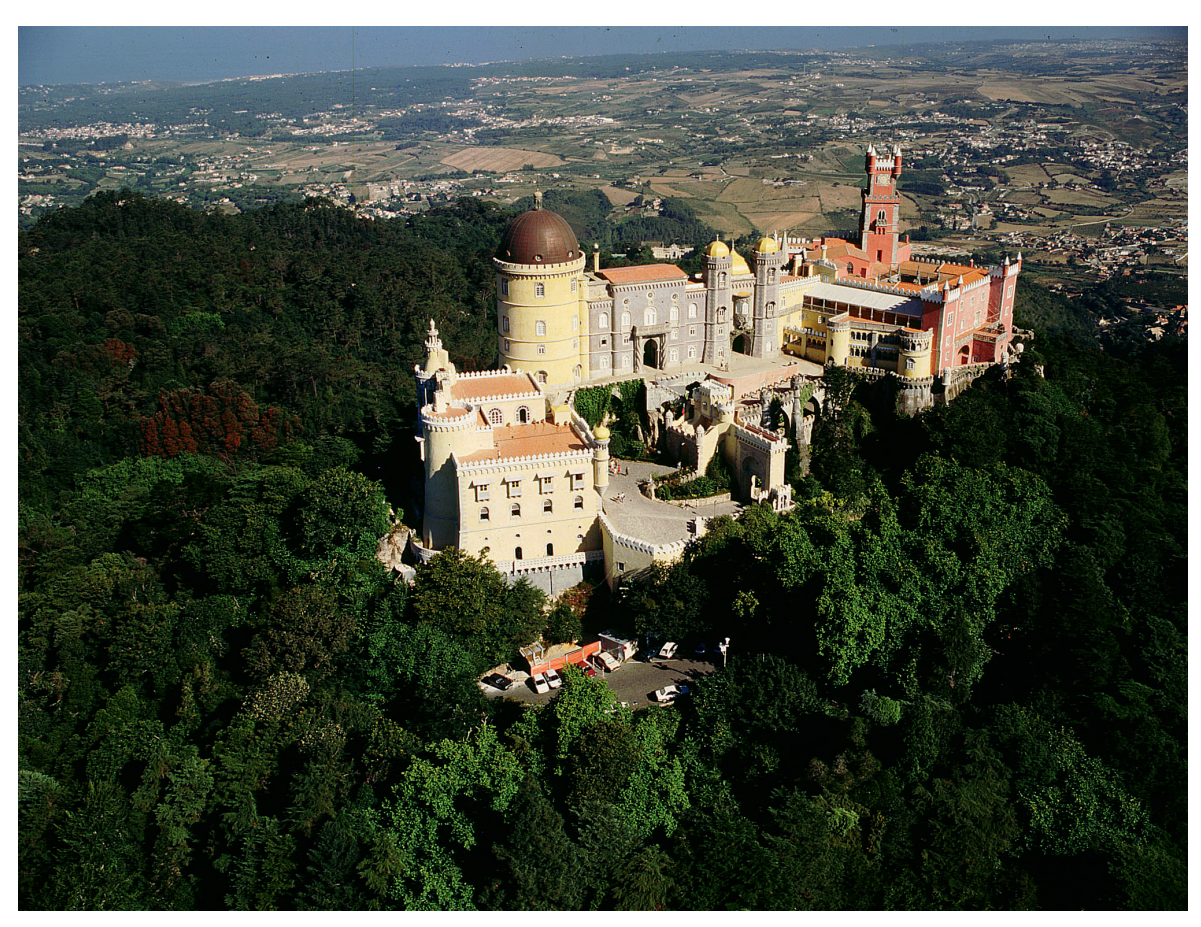
1 National Palace of Pena, the Romantic Castle, PSML, Luís Pavão