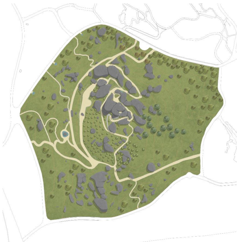
Figure 17 – Tea Hill Master Plan (PSML, 2015).

The undergoing restoration project of the Tea Hill includes work on the built structures: the original network of paths (granite irregular pavements and associated granite walls), and the traditional water supply network including the decorative ponds.