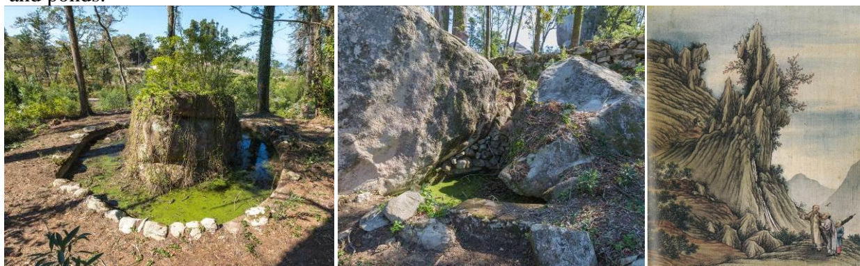
Figure 23 and 24 - Ponds and a cascade at the Tea Hill (PSML, 2015).

Also key in the development of camellias is the proximity to an abundant source of water, as this species is particularly needy in this regard. This presence of water is clearly represented in the next image, were we can see a waterfall tumbling out of the fractures in the rocks. In much a similar way water has a great artificial presence in the Tea Hill through man-made cascades and ponds.