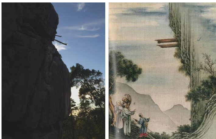
Figure 26 - Source of water, depicted by Cantonese painters.

The travellers in the image with “their postures and gestures underscore the allusions of the painting, whose subject is as much the contemplation of nature, via a backdrop of misty mountaintops fading into the distance, as it is the observation of the tea shrubs and pine trees which punctuate the foreground”(Frères 2002).