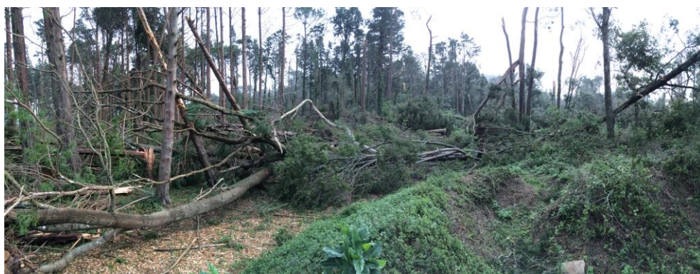
Figure 13 – After the storm (PSML, 2015).

Following another violent storm that hit Sintra in the 19th of January of 2013 the existing conditions have changed. The once very dense arboreal crown has opened up due to the fact that many trees either fell during the storm or were felled for safety reasons thereafter.