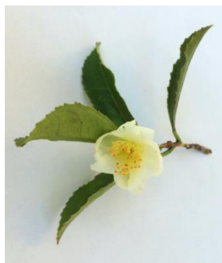
Figure 14 - Specimen of Camellia sinensis showing severe pruned trunks.