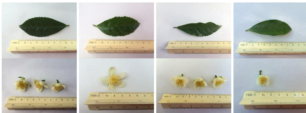
Figure 16 – Measurement of Camellia sinensis leaves and flowers.

Based on the survey and according to Gao Jiyin, on his publication “Collected Species of the Genus Camellia ” were identified 4 cultivars of the specie Camellia sinensis var. sinensis : leptophylla , parvisepala , pubicosta , gymnogyna .