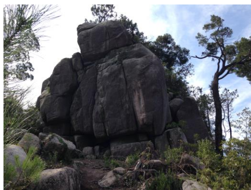
Figure 10 - Perspective on the granite boulders (PSML,2015).

In 2015 the restoration project of one of the most special garden areas began - the Tea Hill. The intervention area spans across 4,98 hectares inside the park. The garden is structured by a network of paths that steadily climb and go over the top of the granite cliffs, where a viewing point can be found and enjoyed, corresponding to the third highest point in the Park of Pena 450m above sea level (behind the highest the High Cross 528m above sea level and the Palace of Pena).