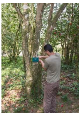
Figure 9 - Tree labeling (PSML, 2013).