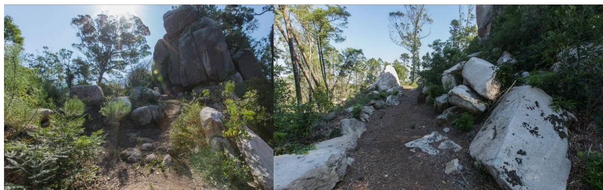
Figure 19 - Path (PSML, 2015).