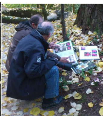
Figure 6 - Camellia japonica 'Dom Fernando II de Portugal'.