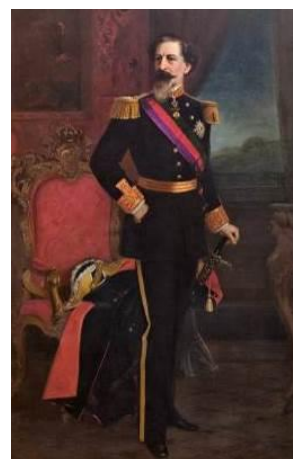
Figure 1 - King Ferdinand of Saxe-Coburg and Gotha (J.F. Layraud, 1877).

In 1838, the king consort bought the abandoned Hieronymite monastery of Pena, transformed it and built a new palace.