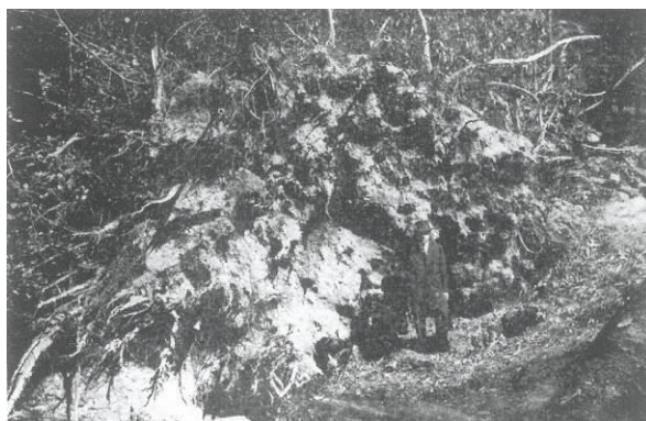
Figure 11 - Professors from the Instituto Superior de Agronomia – Universidade de Lisboa (Agronomy School) in front of a large eucalyptus.